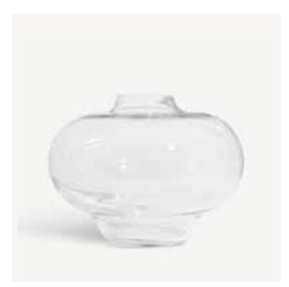
7042204 New Kappa vase Clear H 225 mm W 300 mm