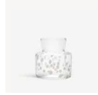
7042207 New Meadow vase Winter H 115 mm W 114 mm

What would the world be without flower meadows? And what would a home be without beautiful vases that can embrace a piece of nature? Tulips, roses, a small shy bouquet or a large wild flower arrangement - with Meadow there is a vase for every bouquet. And don't worry; if you don't like flowers (or they don't like you) Meadow is just as beautiful on its own. An ornament worthy of its own place in the heart of every home. Meadow is created with nature as inspiration. While still warm, the vases are rolled in small pieces of colored, crushed glass. The glass pieces melt into the vase and become a part of the glass itself, and each vase becomes unique. The combination of the straight shapes and the organic pattern creates a playfulness that highlights the craftsmanship, just as the shape of the vases themselves embrace and highlight the plants they hold.