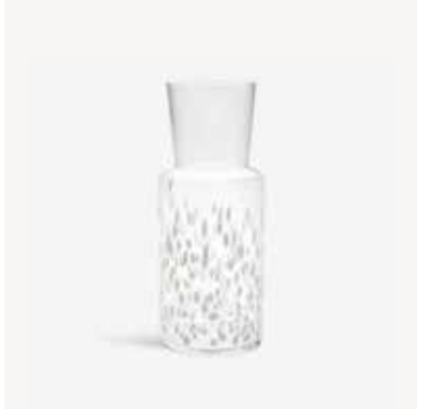
7042209 New Meadow vase Winter H 300 mm W 125 mm