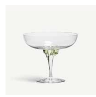
7092005 Sugar Dandy coupe Green H 125 mm W 140 mm 32 cl

This collection consists of oversized coupe glasses with a dash of color that makes it easy to create unique table settings with a dandy feeling. And who said size doesn't matter? No one wants a small glass of champagne! The bigger the glass, the more drink will fit no matter whether it's water or bubbles. It also takes a little concentration to drink then, which gives your drink the attention it deserves. Or why not break the rules completely and serve some dessert from a glass? It's all up to you, sweetie. The collection launched in 2010.