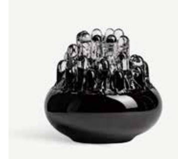
7062006 Polar votive Black H 330 mm W 330 mm