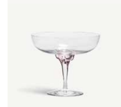
7092007 Sugar Dandy coupe Pink H 125 mm W 140 mm 32 cl