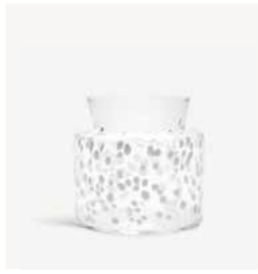
7042208 New Meadow vase Winter H 200 mm W 205 mm