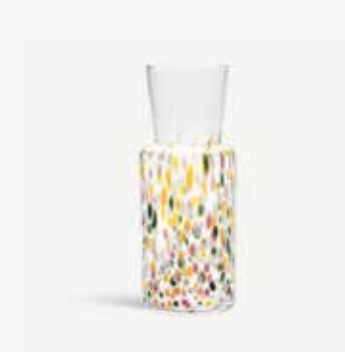
7042227New Meadow vase Spring H 300 mm W 125 mm