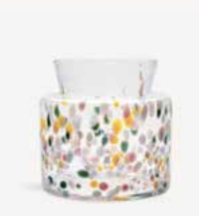
7042226 New Meadow vase Spring H 200 mm W 205 mm