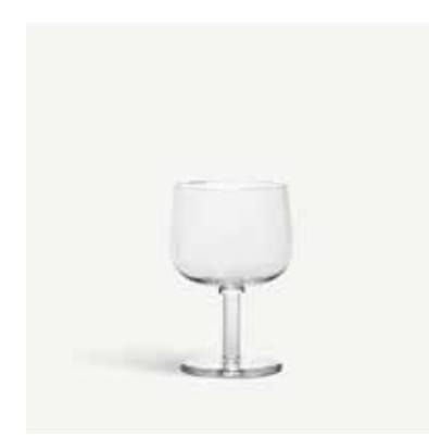
7092004 Viva glass Clear H 142 mm W 92 mm 35 cl 2-pack

7092002 Viva glass Clear H 90 mm W 76 mm 20 cl 2-pack