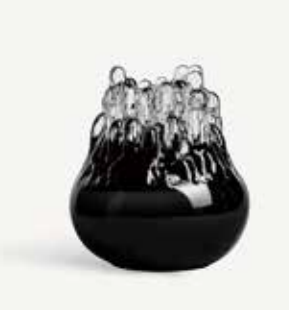
7062113 Polar votive Black H 200 mm W 200 mm