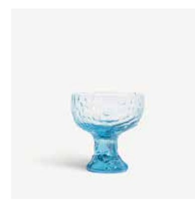
7092211 New Moss coupe recycled Recycled H 115 mm W 114 mm 34 cl