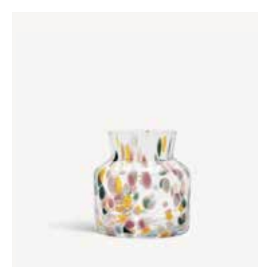
7042225 New Meadow vase Spring H 115 mm W 114 mm