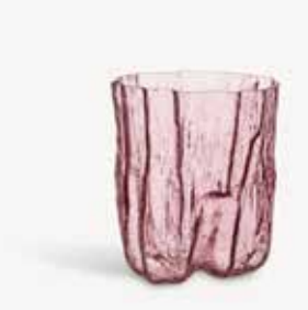
7042113 Crackle vase Pink H 270 mm W 205 mm