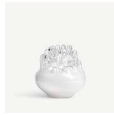
7062111 Polar votive White H 200 mm W 200 mm