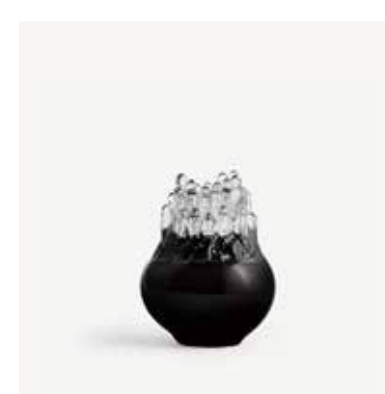
7062114 Polar votive Black H 190 mm W 160 mm