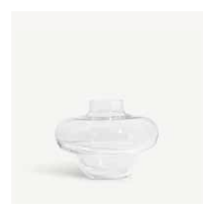
7042223 New Kappa vase Clear H 160 mm W 200 mm

The collection is mouth blown in a mold and named after the small bubble - or cap - that rises over the edge in this process. It's also the cap that's been the inspiration behind the shape of the vases - a shape that makes them beautiful, wonderful and inviting. Kosta Boda's Kappa is designed for a sustainable future, and is at the same time a tribute to the craft history of glass. Isn't that enough to make one feel all bubbly inside? The collection launched in 2021.