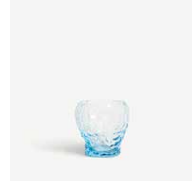
7092209 New Moss tumbler recycled Recycled H 84 mm W 85 mm 26 cl