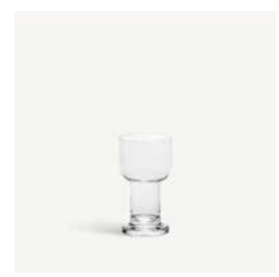
7092100 Picnic smal glass Clear H 136 mm W 77 mm 32 cl 2-pack

With Picnic, there are no limits and it's the inside that counts. The stout stem of the glasses holds liquid all the way to the bottom, which allows the color of the drink to set the tone of the day. Make life colorful! How about some green juice on a Saturday or sparkling rosé on a Tuesday? You know, life's a party - do it your way.