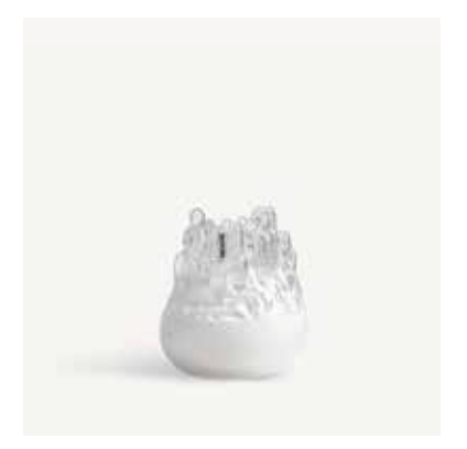
7062110 Polar votive White H 190 mm W 160 mm

Nature, light and ice can be really fascinating. It was out of the love for these elements Polar was born. The collection consists of several glass sculptures reminiscent of rippling water during a moment frozen in time. Doubling as candle holders, the depths of the clear glass becomes a carrier of light, which allows the sculpture and the play of light to create a work of art that feels alive. Polar from Kosta Boda invites to combine several pieces of different sizes to create a playful group, as well as keeping a single piece as an exclusive design object in an art-loving home. Or as a unique gift, from Sweden to the Sydney Opera house for example (true story).