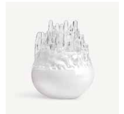
7062112 Polar votive White H 330 mm W 280 mm