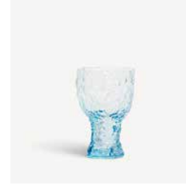
7092208 New Moss highball recycled Recycled H 135 mm W 88 mm 37 cl

With sustainability in focus! Moss from Kosta Boda is created from reused old molds from Kosta Glasbruk that are carved out by hand to produce new shapes, creating the blown textured surface. The glass gets unique color variations because it is made on circular glass, where crushed glass and spills are used. Small bubbles can also appear in the recycled glass - a perfect base to fill with even more bubbles!