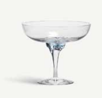
7092006 Sugar Dandy coupe Blue H 125 mm W 140 mm 32 cl